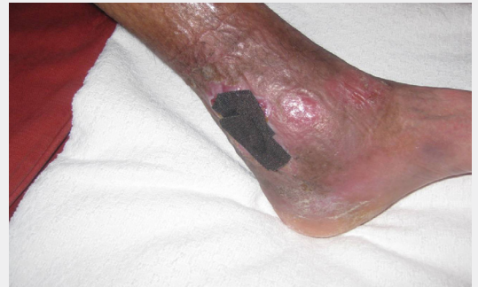
Improvement to ulceration after 3 weeks of treatment with ACTICOAT Flex